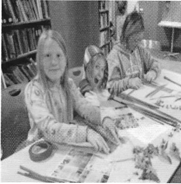
Plant magic program